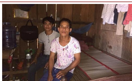
Male boarders in their rented room