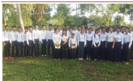
The boarding students of Pich Chenda