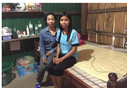
Female boarders in their rented room