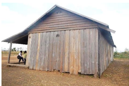
The existing, old and rotten Pcheuk Chrum Primary School building