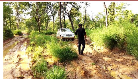
The roads to the school become muddy during the rainy season