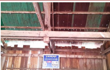
The zinc roof causes the temperature to increase during the hot season and is noisy when it rains