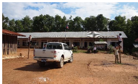
Welcome to the huge Sam Soum Secondary School complex