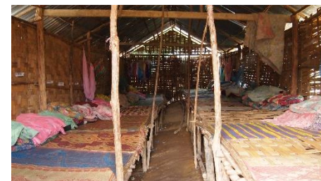
These boarding facilities do not provide adequate protection from the weather elements and are unhygienic