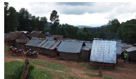
Boarding students build and live in their own, often rotten huts under bad conditions