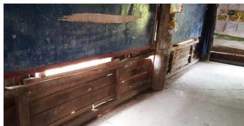
The building is deteriorating fast and is unsafe for the school children