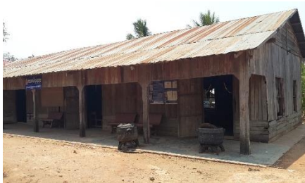
The existing, old and rotten Sokha Pibal Primary School needs urgent replacement