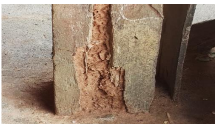
Some columns are being infested by termites and are close from collapsing