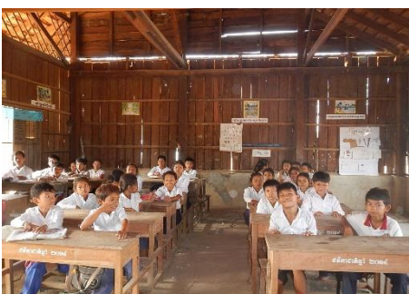
Primary school students attending class in a building not protecting them from the elements