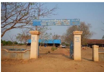
Welcome to Dambok Khposh Primary School, which currently has one usable and one rotten building