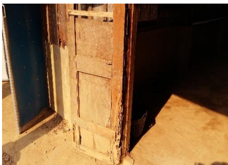
The old building is deteriorating fast and might collapse anytime