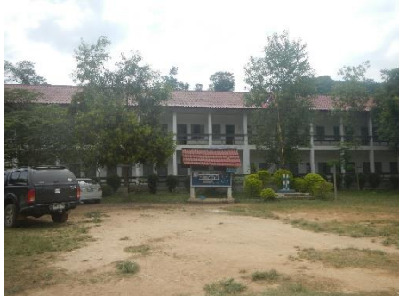
Welcome to Phonsai Secondary School complex