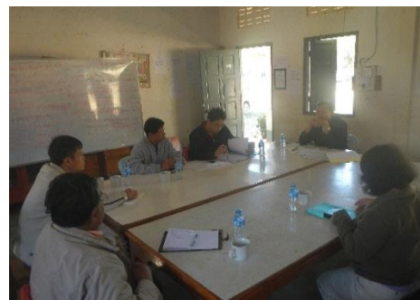
Meeting with the community to discuss their own contribution and involvement