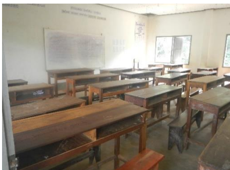
Even without students the classrooms are overcrowded and there is hardly space to walk