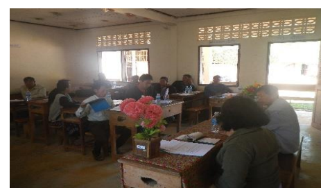
Meeting with the community members