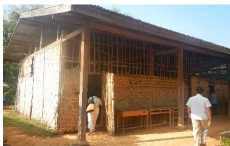
The temporarily school building doesn't provide a safe learning environment and is rotten