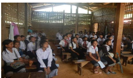
Classrooms are often very crowded and loud