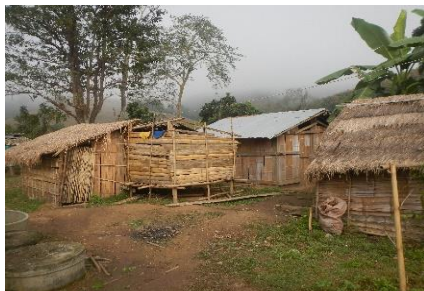
The temporary shelters are mostly made out of indigenous building materials and required constant repairs