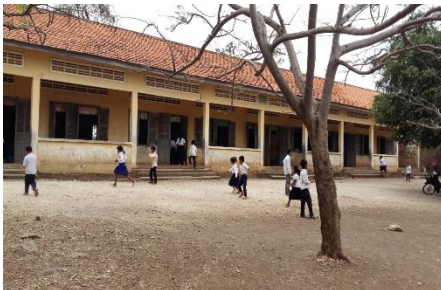
Welcome to Phnom Prampy Primary School, which currently has one rotten and two old buildings.