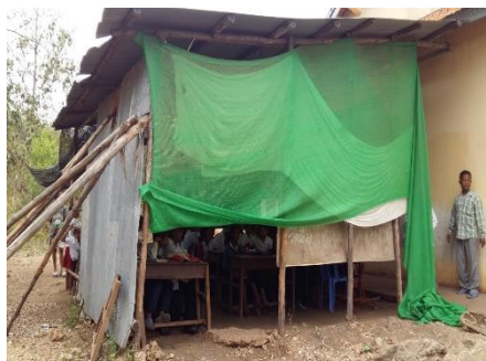
The temporary building is unstable and doesn't protect the students from the elements.