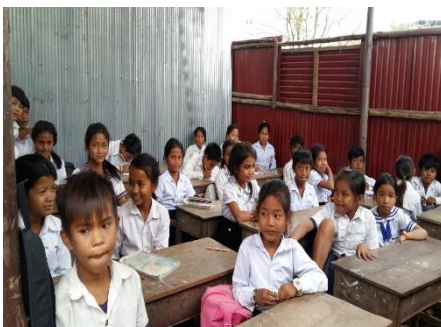
Classrooms are often very crowded and loud and conducted in a rotten facility.