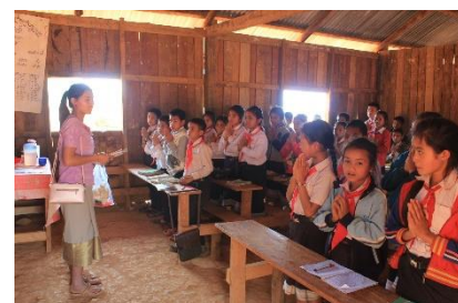
The students of Mok Kha Lower Secondary School