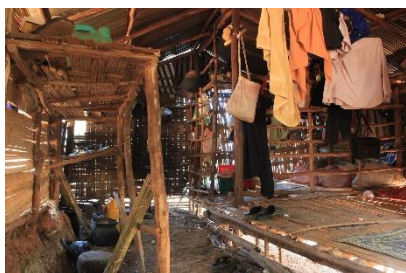
The current boarding facilities are inadequate, dangerous, unhygienic and in dire need of replacement