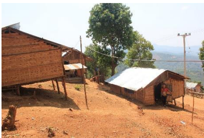
The makeshift boarding houses were built on the slope of the hill and are very challenging to access during the rainy season