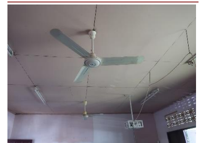
The existing projector and ceiling fans