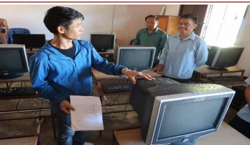
The existing, old computer lab