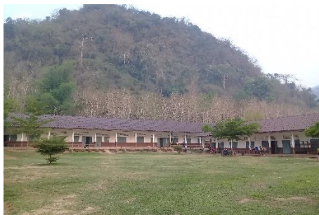
Muang Kob Secondary School