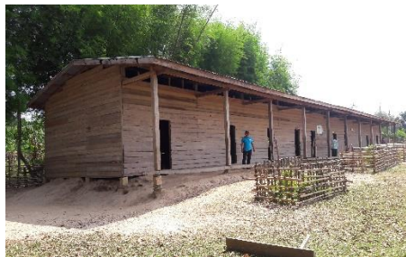
Na Lao Primary School's only building is no longer safe to use and thus is in dire need of replacement.