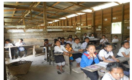
Students find it hard to concentrate because there are no walls separating the classrooms.