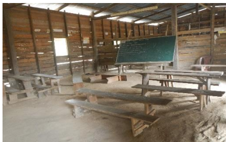
The ramshackle classrooms are neither comfortable nor motivating.