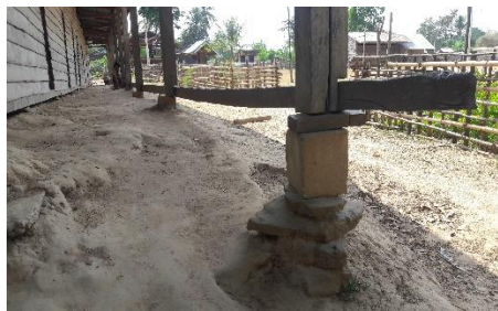
The wooden posts are supported only by large stones. The building is on the verge of collapsing.