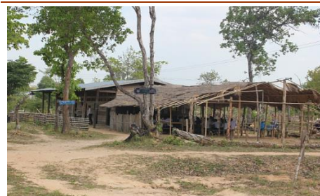
The building is very unstable, rotten and exposes the children to the extreme weather condition