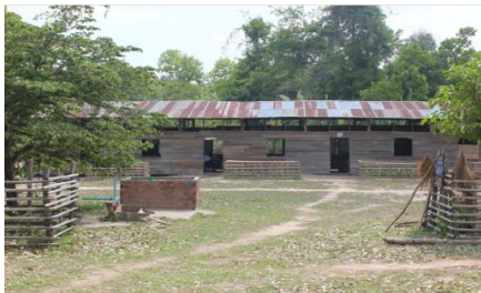
The school building doesn't provide a safe learning environment and might collapse anytime