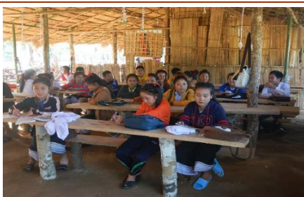
Classrooms are overcrowded and loud and pose a health risk for the children