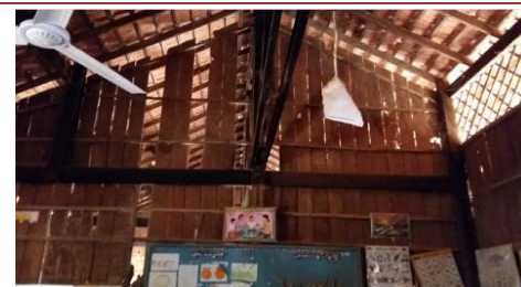
The existing, rotten O Khcheay Choeung Primary School