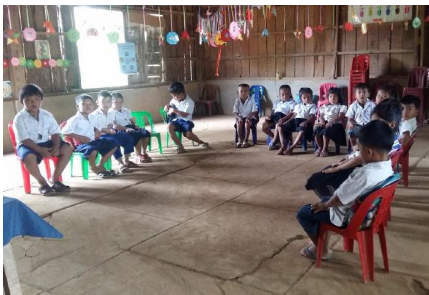
Students at O Khcheay Choeung Primary School