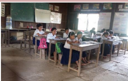
The building has deteriorated overtime and has become unsafe for the school children