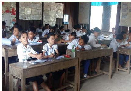
Inside the old school building. The zinc roof causes the temperature to increase during the hot season and is noisy when it rains