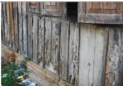
The building has deteriorated dramatically over time and becomes unsafe for the school children