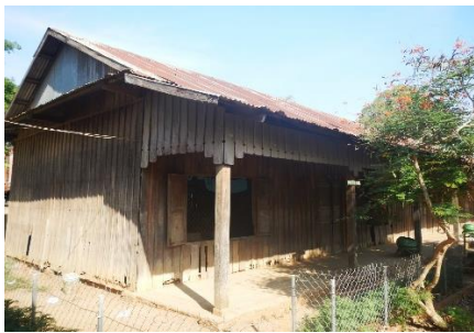
One of the rotting temporary wooden buildings with zinc roofing