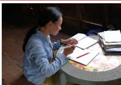
Student in a rented and overcrowded room