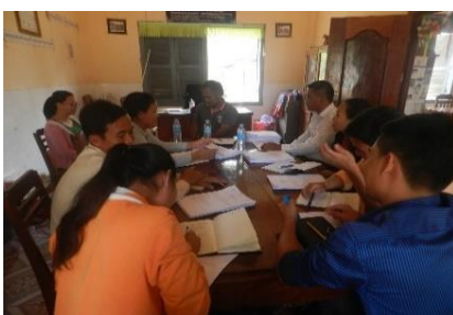
Staff meeting with the school management