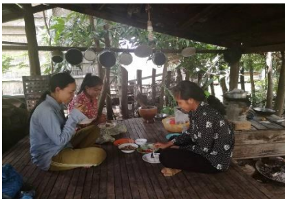
The makeshift boarding houses are rudimentary and in dire need of replacement