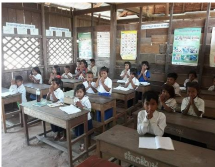
Chreung Khang Lech Primary School