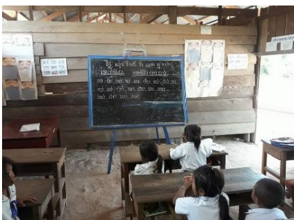
Students attending class in one of the classrooms of the old building