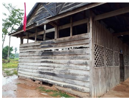
The building is deteriorating fast and is unsafe for the school children