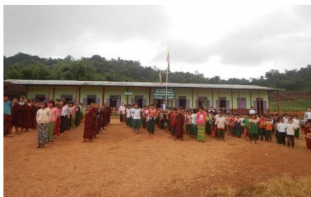
To date, a total of 240 students from primary 1 to lower secondary 2 attend school at Pan Lon Kha School. The student population is expected to