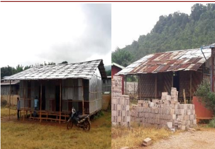
The two temporary buildings with one classroom each are unsuitable and in dire need of replacement.