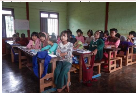
The classrooms are very cramped creating a chaotic and loud environment for the young students.