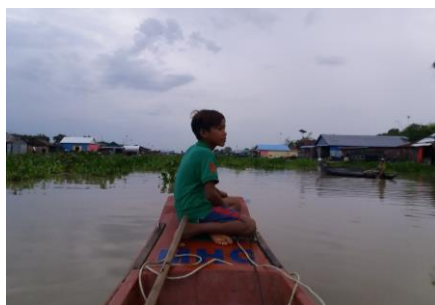
Children and teachers arrive at school by boat, since the village is only accessible over water.