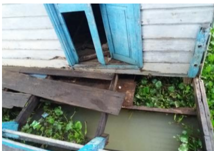
One of the existing buildings is very damaged but is still being used for classes. Needs urgent replacement.