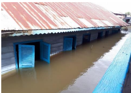
The other building has deteriorated dramatically over time and sunken into the water.