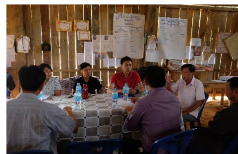
Meeting with the community members and the school committee