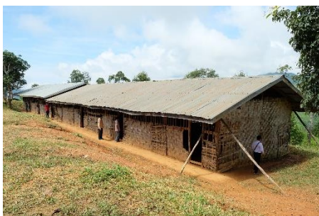
The school building does not provide a safe learning environment and has many holes in the walls