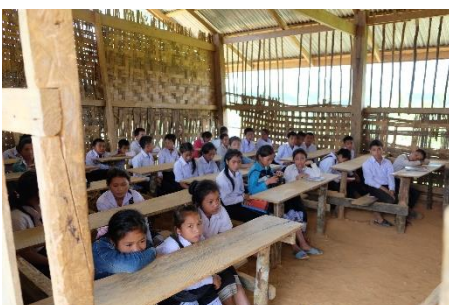
Classrooms are very crowded, rotten and loud. This is not a conducive learning environment