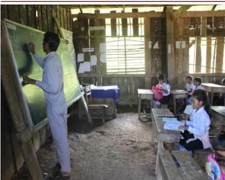
Teaching materials and furniture are worn out, dirty and urgently need to be replaced. The dirt floor gets very muddy during the rainy season.