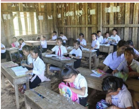
The existing school building gets hot, is cramped, noisy and dusty, making it difficult for students to focus on their education.