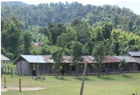
The old zinc-roofed wooden building is no longer safe enough for the students and might collapse anytime soon.