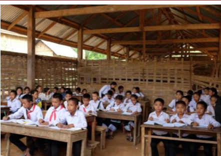
The buildings are in very bad condition, are unstable and the classrooms are very crowded