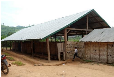
Welcome to Phon Thong Secondary School