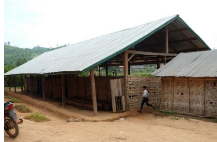
Welcome to Phon Thong Secondary School