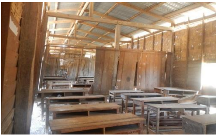
The tin roof, the wood walls and beams are perforated and do not offer protection against rain and wind.

In order to improve the existing insufficient learning environment, we will construct one new school building with five fully furnished classrooms and four additional toilets. As with all our projects, the local community will be involved in the construction process. Involvement of the community is critical, as it encourages a stronger sense of ownership over the project. They will contribute wood for structure and roofing. The Laotian Government is responsible for the teachers' salaries and the provision of learning materials. We will select a trusted local contractor to coordinate all phases of construction and to purchase all needed construction materials. The contractor will be paid in four instalments based on the construction progress, with 5% of the total labour cost being held back for one year as a guarantee for the quality of the work. The Laotian Government and the local community will be responsible for the school building once the construction is completed. We consider this project as low risk. The school is accessible by road all year. It takes approximately one and a half hours from Savannakhet city to access the school. We aim to start construction by May 2018 and completion is expected by the end of October 2018.