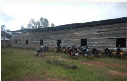
The wood foundations are also unstable and very scary for the students, their parents and teachers. These buildings might collapse anytime soon.