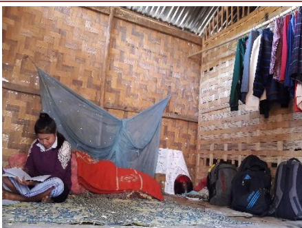
Each house is divided into several bedroom units, of which one unit would be rented to a student as their entire living space and for all their belongings. A common kitchen area is shared by approximately 3 – 4 students who live in the same house building. Everything is poorly constructed and in very basic, run-down condition.