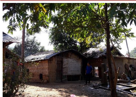
Student accommodation is available for rent around the school area. They are filled by mostly students who come from far-away villages to study at the school and rent is costly.