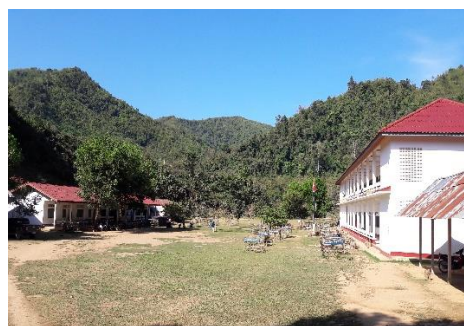
Sob Hueang Secondary School with their two school buildings which are still in good conditions.