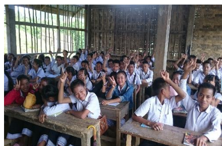
Secondary students attending class in one of the makeshift buildings sitting on piers with bamboo sheet walls.