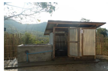
The existing two toilets are old, rotten and not enough for such a large student population.