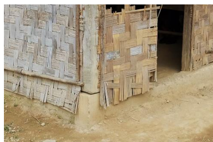
The building's columns are not sturdy and can cause the building to collapse anytime, a possible threat to the safety of the students.