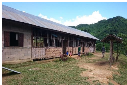
The two temporary structures are dilapidated, beyond repair and in dire need of replacement.