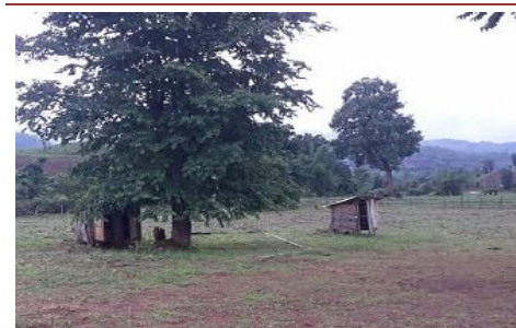
The pit latrine toilets are located a few meters away from the school building; unhygienic and unsafe, especially for female students.