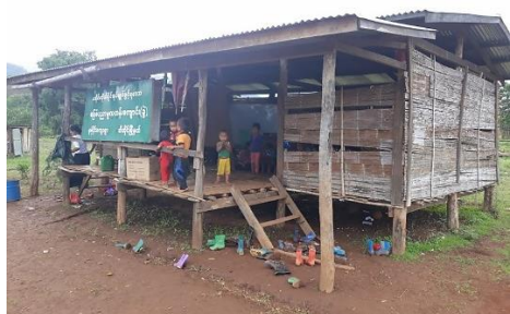
The temporary building with flattened bamboo walls and a zinc roof rapidly deteriorated. With combined substandard materials and poor workmanship, the building is beyond repair and in dire need of replacement.