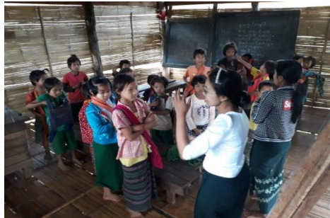
Students studying in the temporary building with flattened bamboo walls and zinc roof. The building becomes unbearably cold during the cold season between the months of November and February.