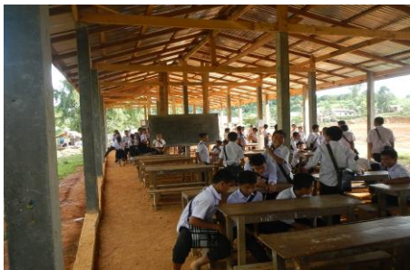
Students attending classes in the unfinished and undivided open hall building. Full of dust and rain.