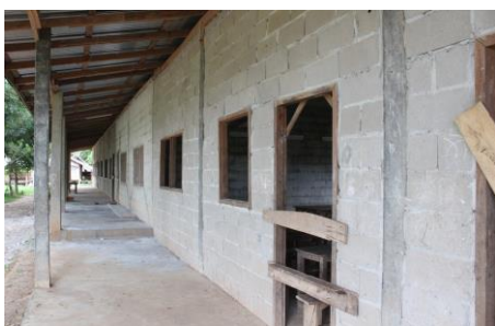
Exterior of the unfinished concrete building with 4 classrooms.