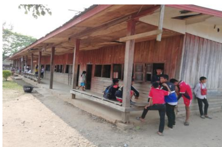
Secondary students waiting for their class outside the dilapidated wooden building.