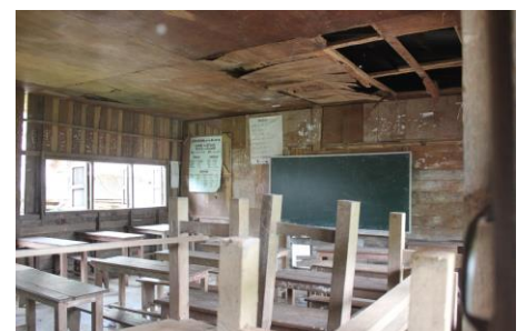
The ceiling of the wooden building has deteriorated notably and is on the verge of collapsing, endangering students attending classes.