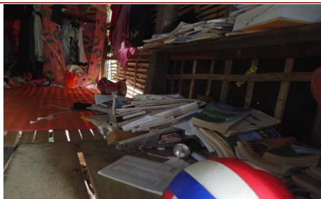
The temporary shelters are mainly made of old and salvaged materials, are rudimentary, and pose a serious threat to the occupants.