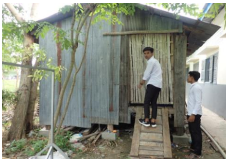
Some students have to resort to living in the self-constructed shacks and provision of proper boarding facility is in dire need.