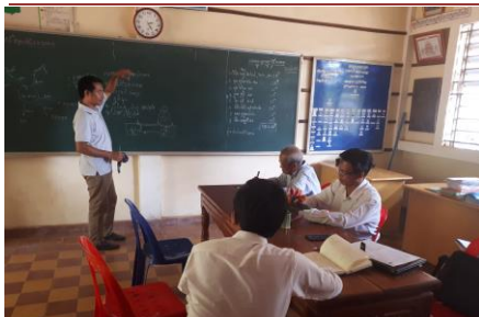
Our field team meeting with school officials to discuss the construction project.