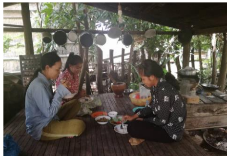
Some students have to resort to living in the self-constructed shacks and provision of proper boarding facility is in dire need.