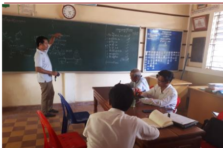
Our field team meeting with school officials to discuss the construction project.