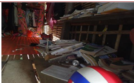
The temporary shelters are mainly made of old and salvaged materials, are rudimentary, and pose a serious threat to the occupants.