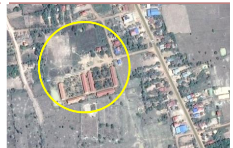
Aerial view of the 28 January High School campus (encircled in yellow).