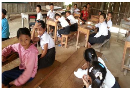
Students attending class in one of the dilapidated wooden buildings.