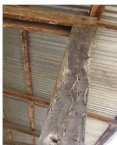
The structures are supported by termite-infested wooden columns, sitting on concrete piers and can collapse anytime.