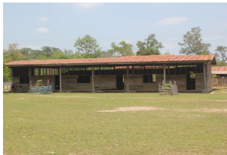
The wooden buildings are dilapidated, beyond repair and in dire need of replacement.