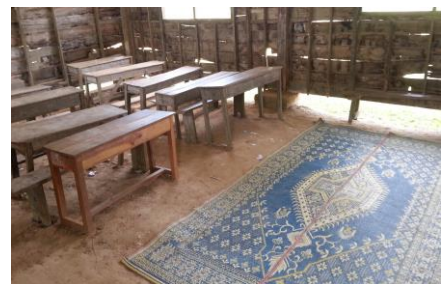
During the hot season, the building interiors become unbearably hot and the students get wet during the rainy season.