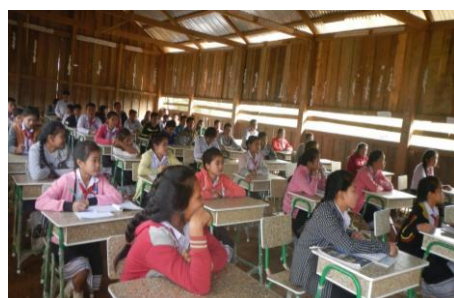
Students attending class in one of the rotten wooden buildings