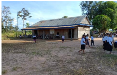
The school building faces serious overcrowding