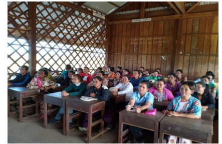
The community attends a meeting with a Child's Dream representative