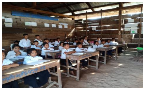
The classrooms lack basic facilities and comfort