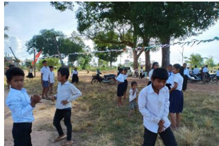
Students of Prasat Toek Khmao Primary School