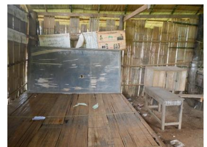
The poorly constructed shack is sitting directly on an unhygienic dirt floor with walls falling apart.