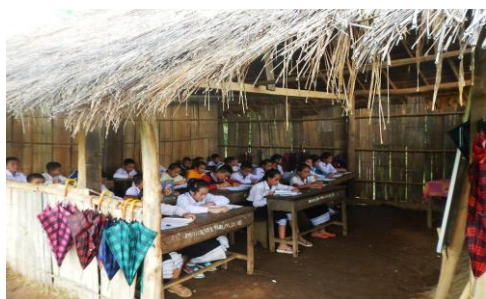
Students attending class in the bamboo shack building often get distracted in this open plan classroom.