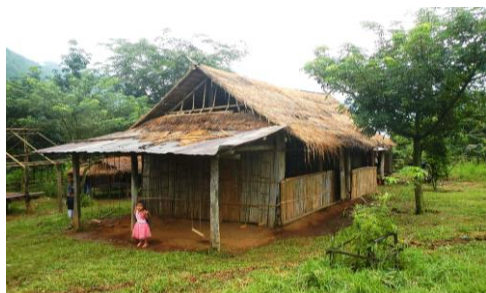
The only building of Nam Kha Lower Secondary School. It's mostly made out of local materials and is fast deteriorating, in dire need of replacement.