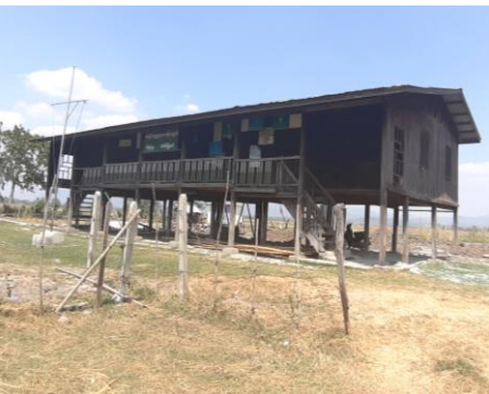
The wooden school building has been derelict for many years already and is in dire need of replacement. It might collapse anytime soon.