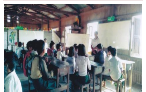
Students attending class in one of the classrooms divided by makeshift walls.