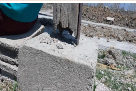
The wooden stilts bolted on concrete piers are severely damaged and on verge of collapsing.