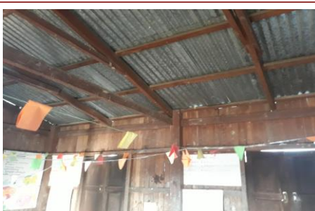
The wooden slat walls and roof trusses are severely damaged by the rain water.