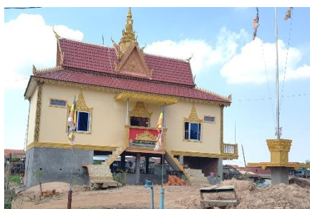
One of the classrooms is at the basement of the monastery, underneath the stairs