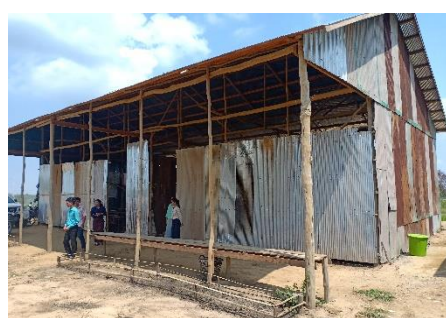
The tin shack building is in a state of great despair and in dire need of replacement