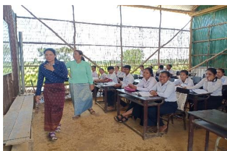
Secondary students attending class in one of the classrooms in the tin ramshackle