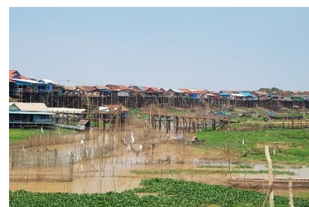
View of the Ta Uo Sar Village from the marshland