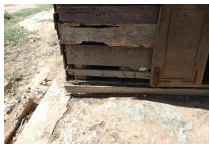
Large holes in an exterior wall