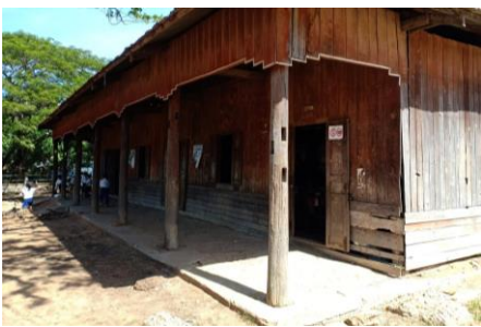
Wooden building at Srah Chaeng Primary School