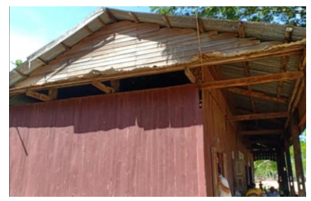
Rotten wood beams support a roof