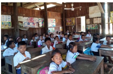
Students attending class in the rotten and dangerous building