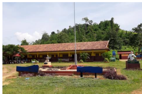
Welcome to Sre Andong High School.