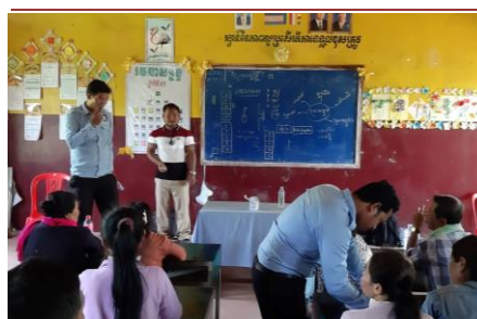
Our field team meeting with school officials and community to discuss the construction project.