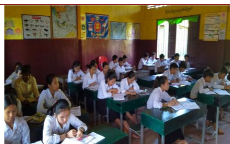
High school students attending class inside one of the classrooms.