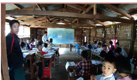
One of the rooms currently being used as a classroom. The temporary shack building is in a state of great despair and in dire need of replacement.