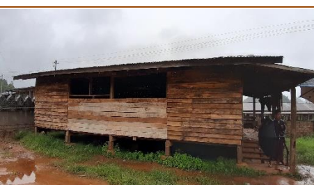
The wooden building which is listed for demolition.