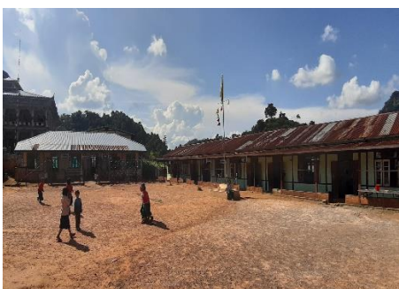
The school and its buildings are in a state of despair and a replacement is needed.