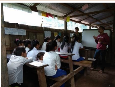
The interior becomes unbearably hot during the hot season and the dirt floor turns muddy during the rainy season