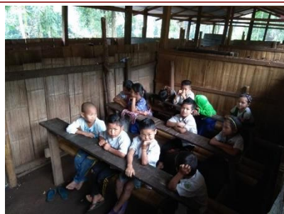
Students attending class inside the un-conducive and unsuitable classroom