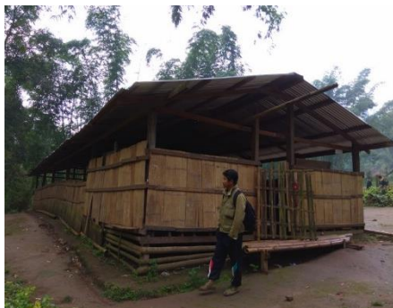
The bamboo building has woven bamboo walls and a zinc roof. It is in dire need of replacement