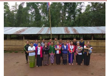
The students outside the school building