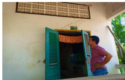
A view of one of the dilapidated school buildings.