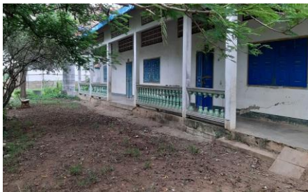
The rotten and dangerous Makloeu Primary School.