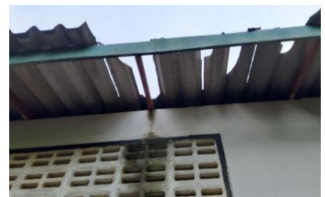
A photo of one of the unsafe roofs. This is not a conducive environment for learning.