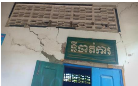
The buildings have become so rundown and can collapse anytime. They are beyond repair.