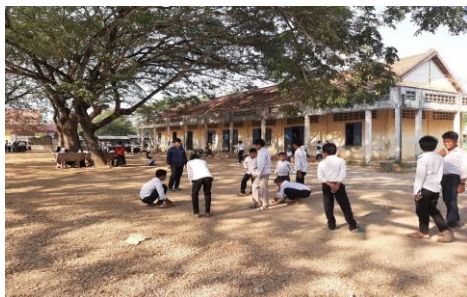
A view of the current school building