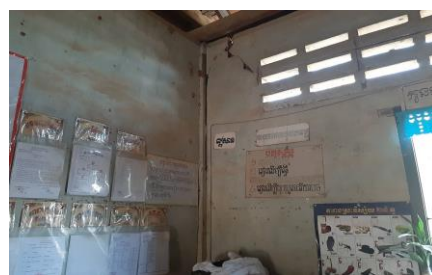
The school building has various cracks in the walls and might collapse anytime