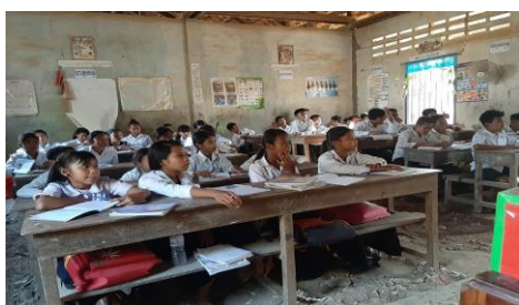
The rundown classrooms do not incentivize students to participate wholeheartedly in their education