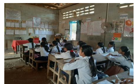
Another classroom in the dilapidated and unsafe building