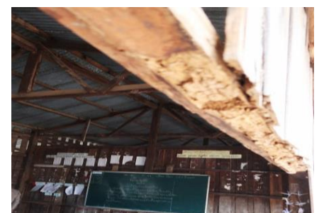
Crumbling walls due to termite damage.