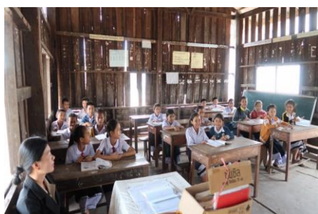
The classrooms are in poor condition and the walls offer little protection from the elements (internal).