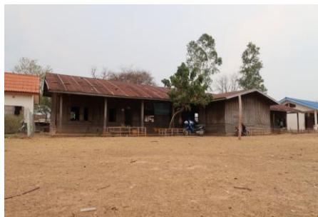
The existing wooden school building is in poor condition and is an unsafe environment for the students and teachers.