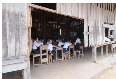
The building is structurally unsound.