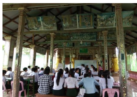
The monastic buildings have been used for the last 4 years to supplement demand, leading to interruption of classes due to religious ceremonies.