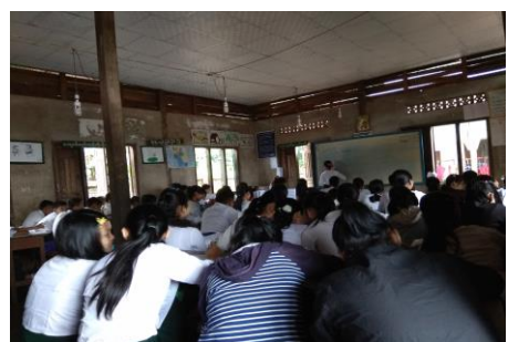
The current building is insufficient for the school's needs due to heavy overcrowding.