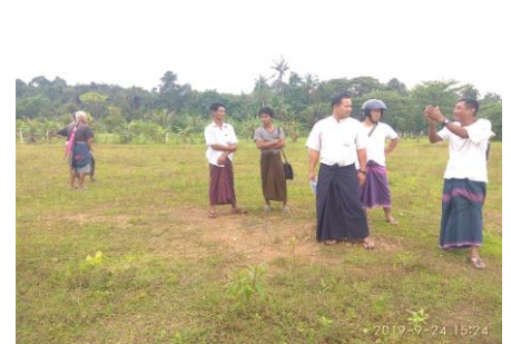
Visit of the 3.5 acre site together with community leaders. The new building will be constructed on this site.