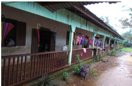
Laung Kaing Branched High School - currently