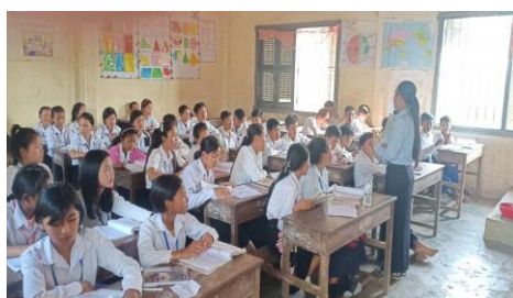
A crowded classroom