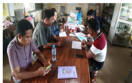
A meeting with the school management