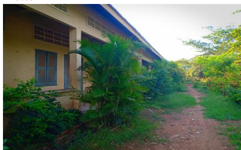
A view of the current school building