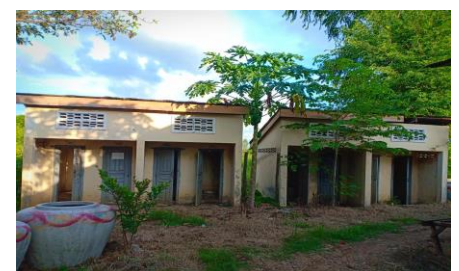
The existing toilets