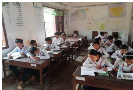
Secondary students studying in the borrowed classroom, leading to a cramped situation for the primary students