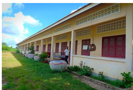
The primary school building