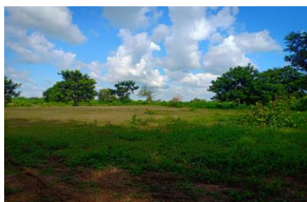
Open area where the new secondary school will be built