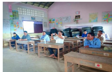
Our local team meeting with officials and other community members to discuss the construction project