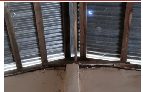
The roof and walls might collapse anytime soon