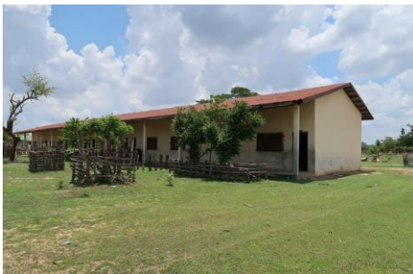
The current, rotten and dangerous school building which was built in 1969