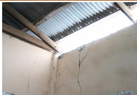
Visible cracks in the walls