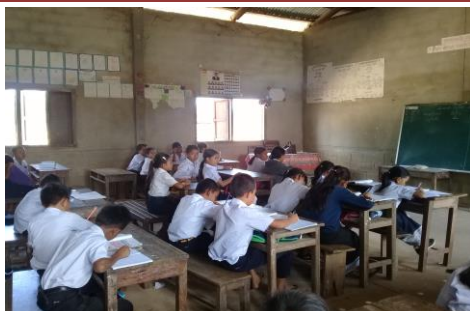
A classroom in the current school building