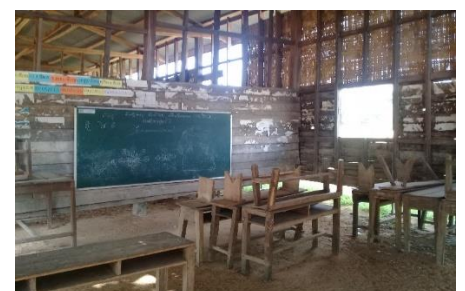
The large gaps between classrooms mean that students cannot fully concentrate in class.