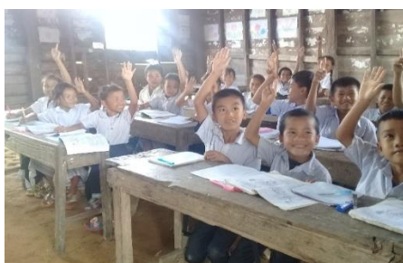
The dilapidated wooden buildings are still being used all grade levels.