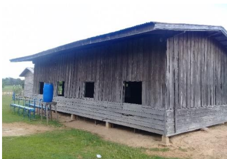
One of the wooden buildings, dated 1978. It has become so rundown and is in dire need of replacement.