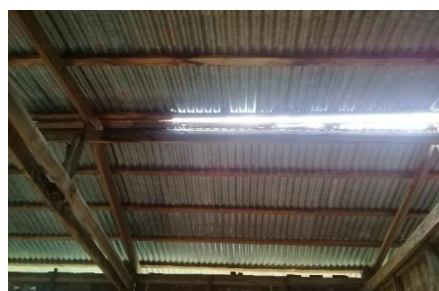
The wooden beams and walls are infested with termites and can collapse any time.