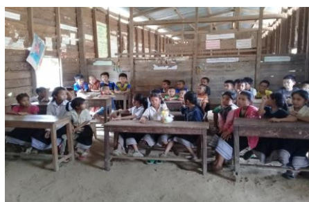
One of the classrooms