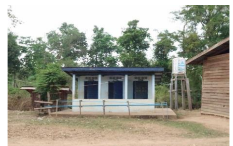
Four new toilets will be built to complement the existing three that are still in working condition