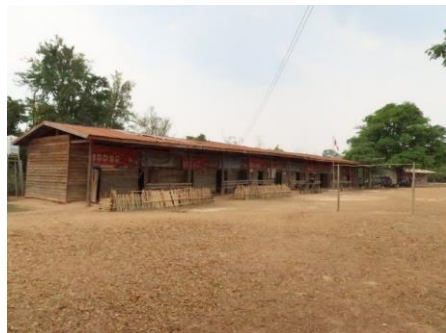
The main school building is rotten and dangerous