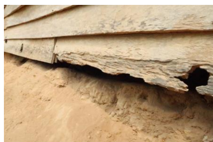
The integrity of the buildings presents severe safety risks to the students and teachers